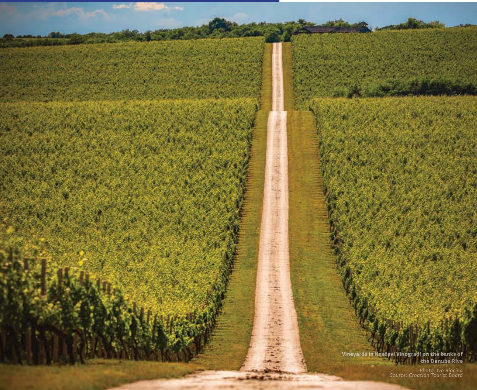
Vineyards in Kneževi Vinogradi on the banks of the Danube River

Croatian Presidency of the Council of the European Union