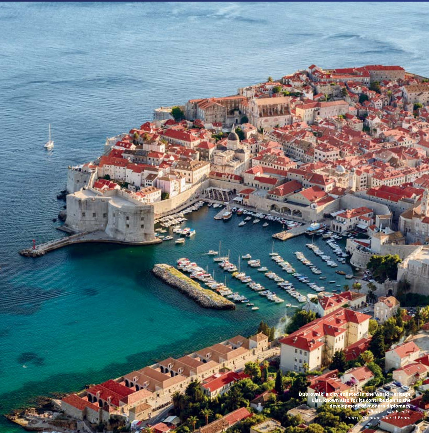
Dubrovnik, a city enlisted in the World Heritage List, known also for its contribution to the development of modern diplomacy