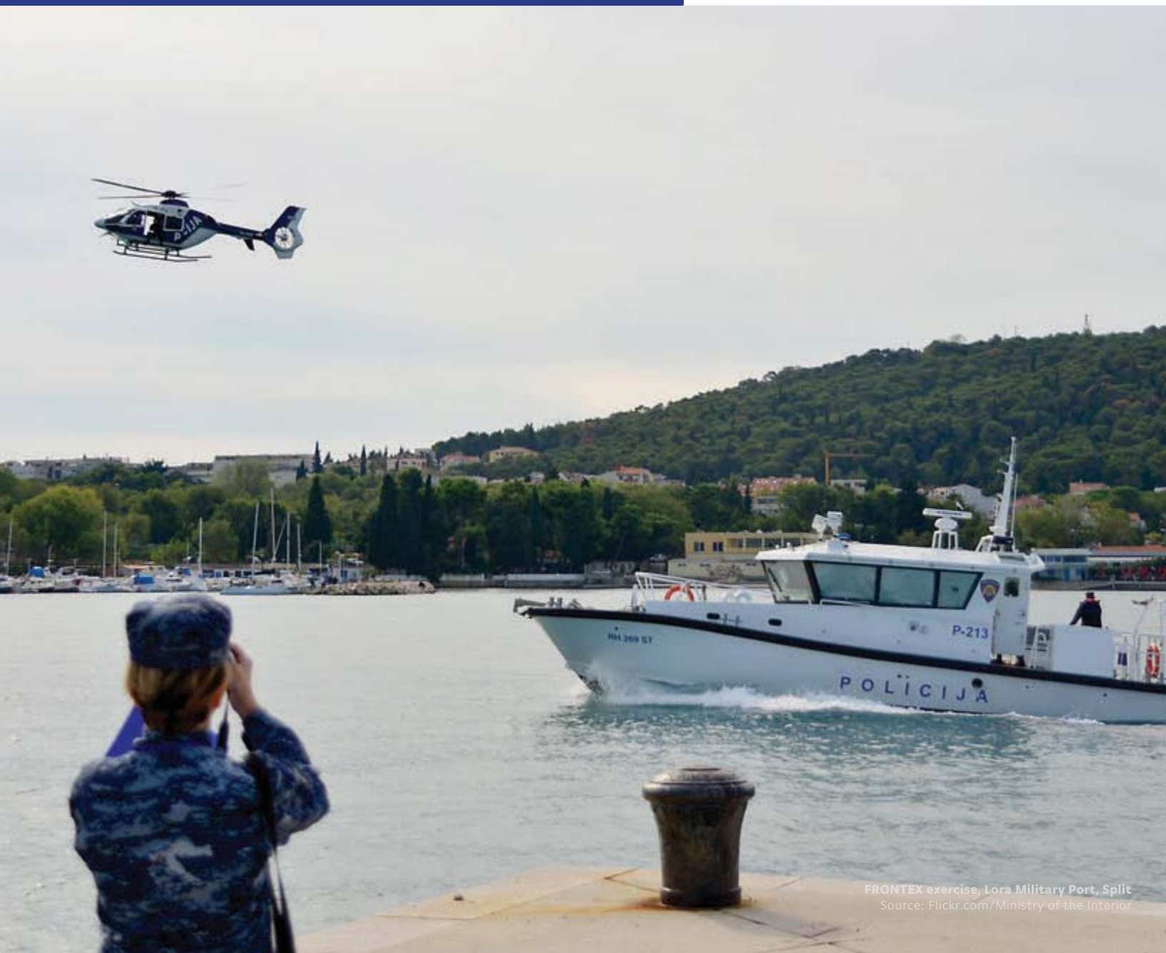
FRONTEX exercise, Lora Military Port, Split

Croatian Presidency of the Council of the European Union