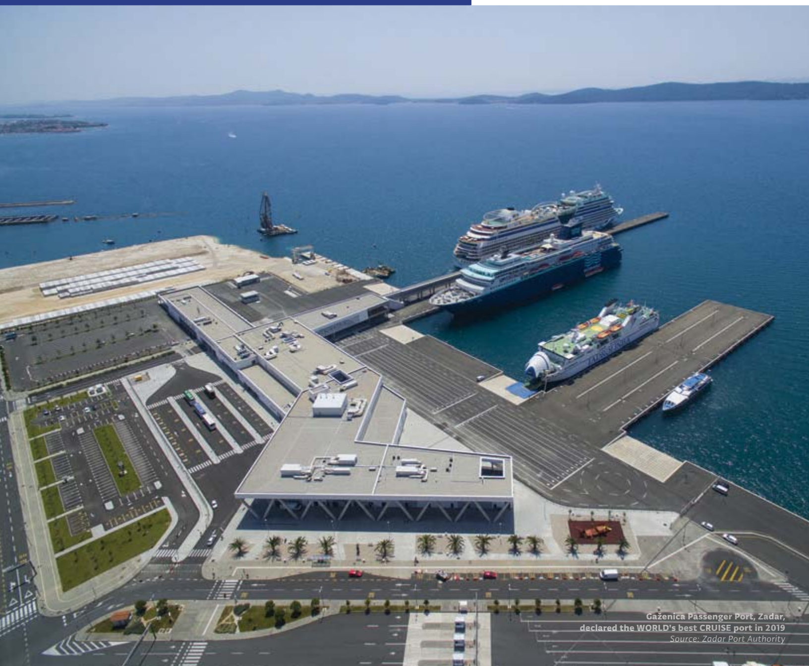
Gaženica Passenger Port, Zadar, declared the WORLD's best CRUISE port in 2019

Croatian Presidency of the Council of the European Union