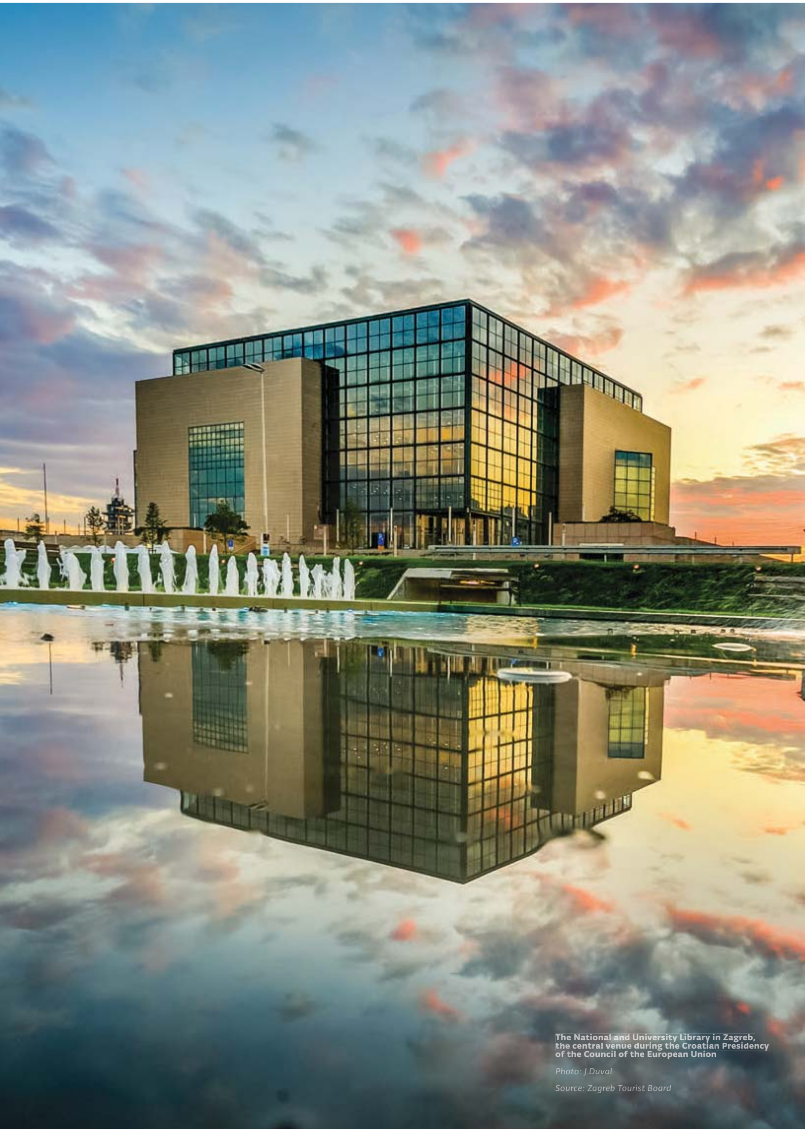
The National and University Library in Zagreb, the central venue during the Croatian Presidency of the Council of the European Union