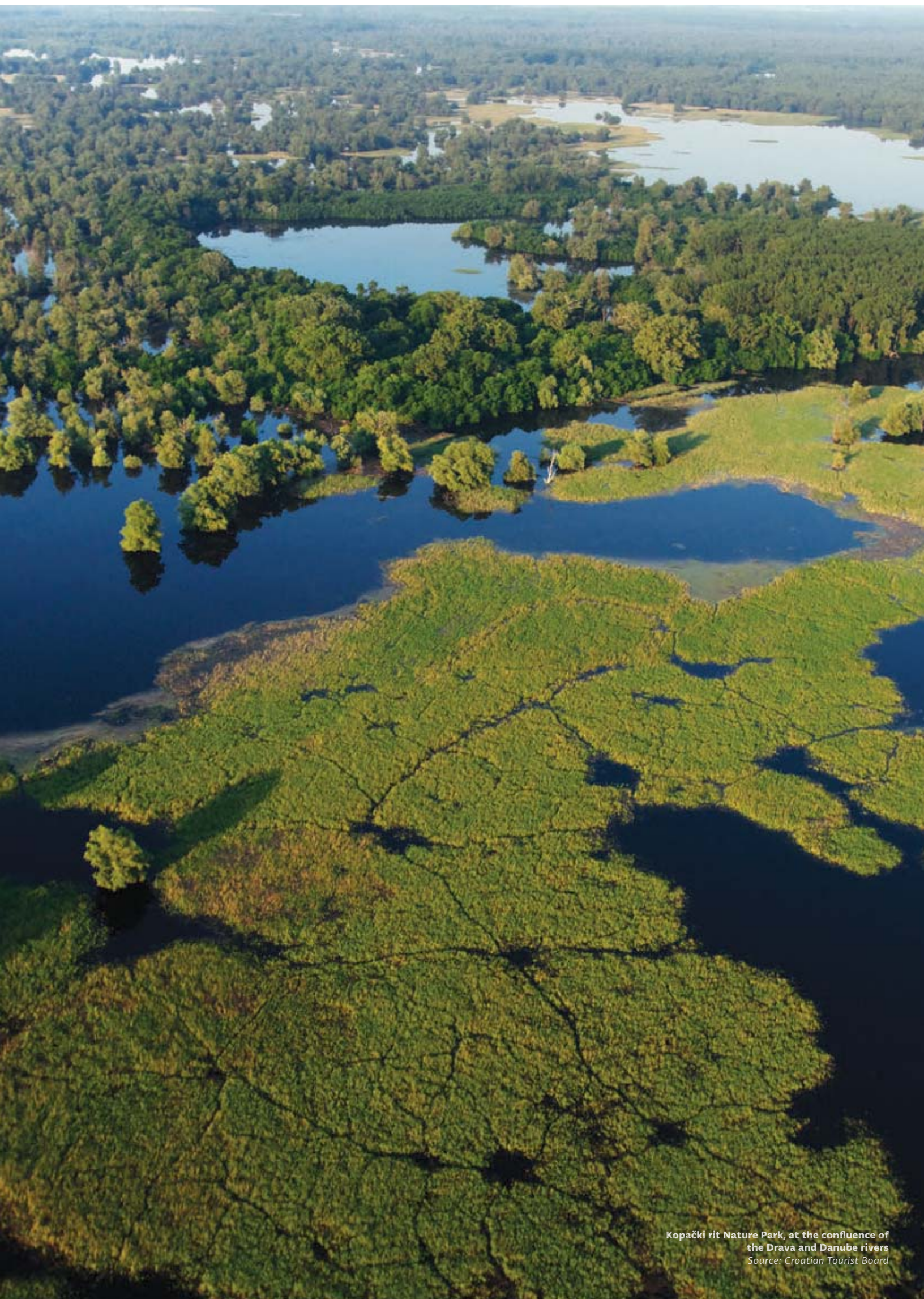
Kopački rit Nature Park, at the confluence of the Drava and Danube rivers