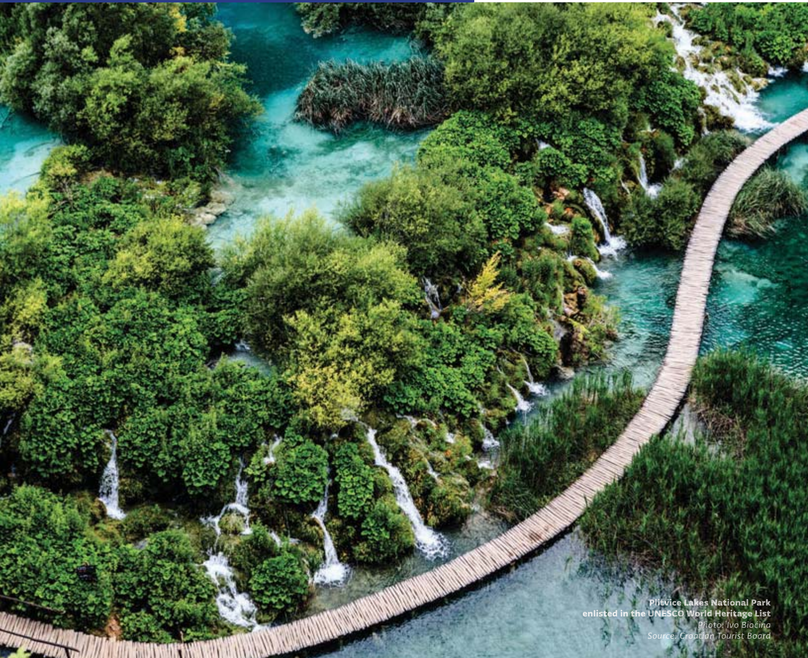
Plitvice Lakes National Park enlisted in the UNESCO World Heritage List

Croatian Presidency of the Council of the European Union