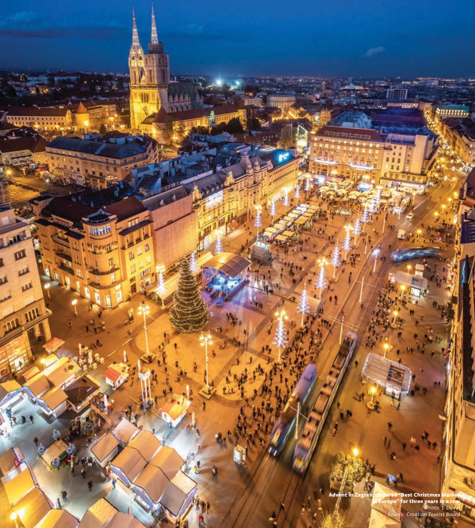
Advent in Zagreb, declared "Best Christmas Market in Europe" for three years in a row