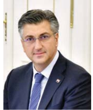
Andrej Plenković Prime Minister of Croatia

From 1 January to 30 June 2020, Croatia will take over the Presidency of the Council of the European Union for the first time. During this six-month period, Croatia will lead the activities of the Council as an honest broker, building cooperation and agreement among Member States in a spirit of consensus and mutual respect.