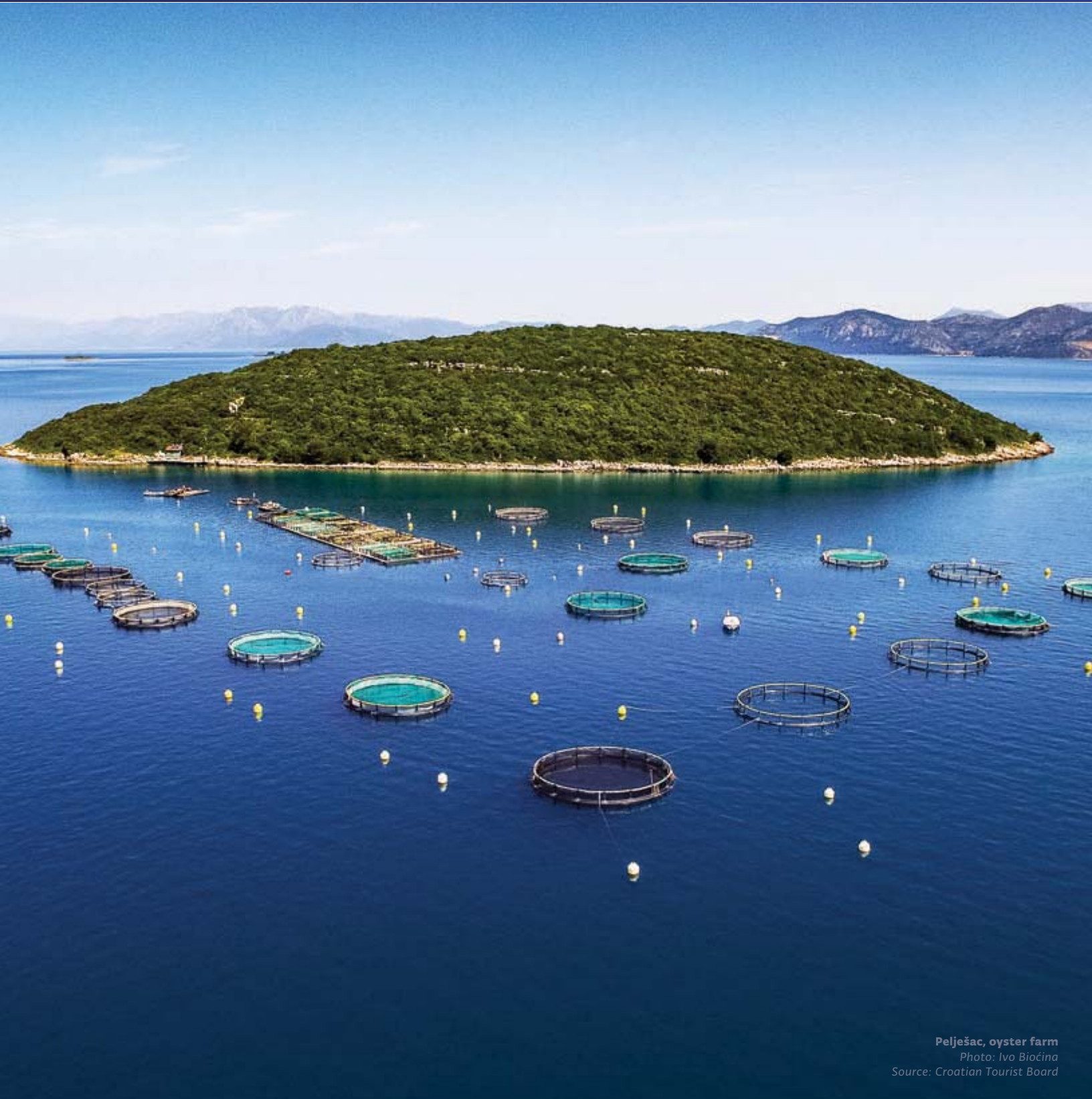
Pelješac, oyster farm